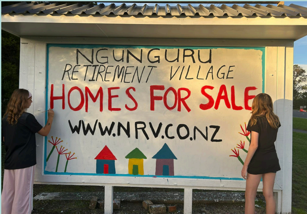
Local students painting the community board for NRV recently